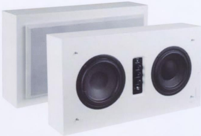
The controls for volume, crossover frequency and bass boost can be found under the cover of the Flatsub One

Flatbox Midi, a two-way bass reflex speaker with an extremely flat overall depth of just 92 millimetres – perfect for wall mounting next to a flatscreen TV.