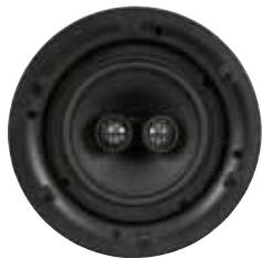
IC646 without grille