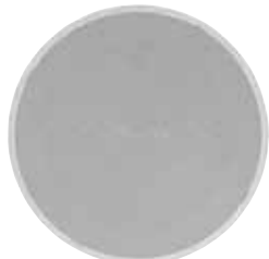
IC646 with grille