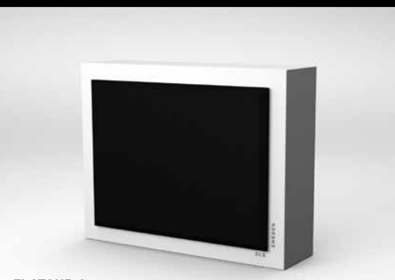
FLATSUB 8 is the perfect choise if you want to hang your sub on the wall, or hide it away under a chair or a sofa. The small dimensions make it easy to hide this active subwoofer wherever you want. The Flatsub 8 matches DLS speakers superbly. Both white and black speaker fronts are included.